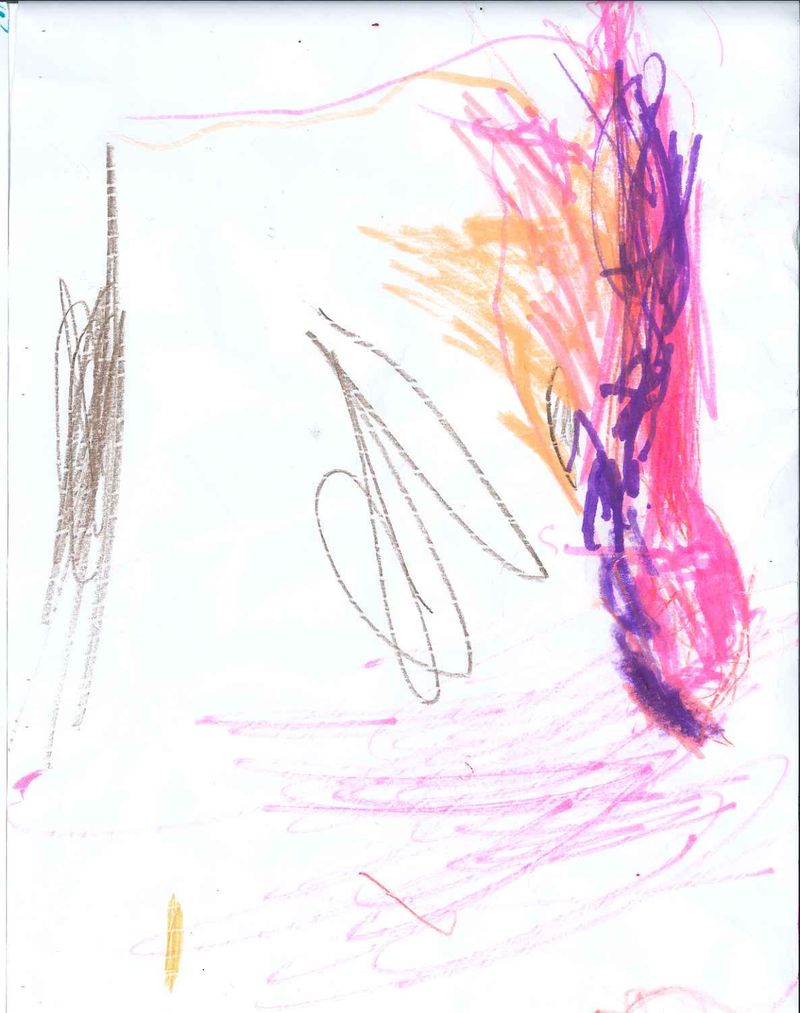
It's a mermaid.