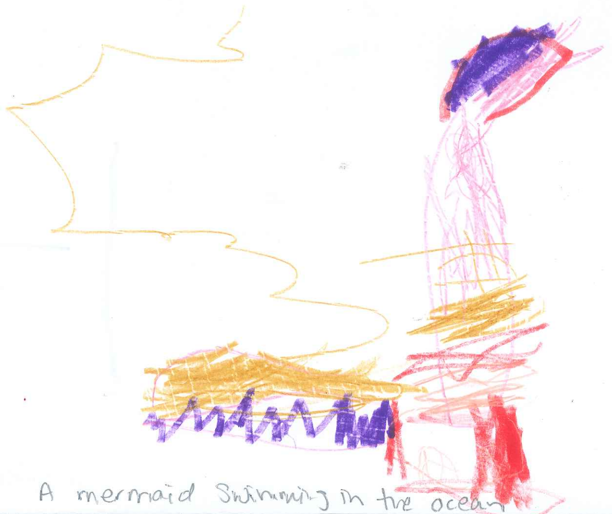
A mermaid swimming in the ocean